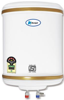
Kenjal 25 LTR