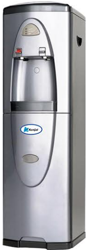
Kenjal Hot & Cold