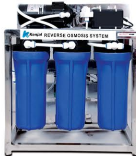
Kenjal 25 LPH RO