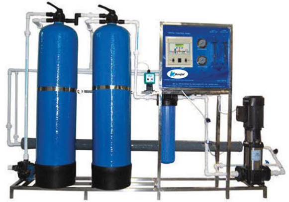
Kenjal 500 LPH RO