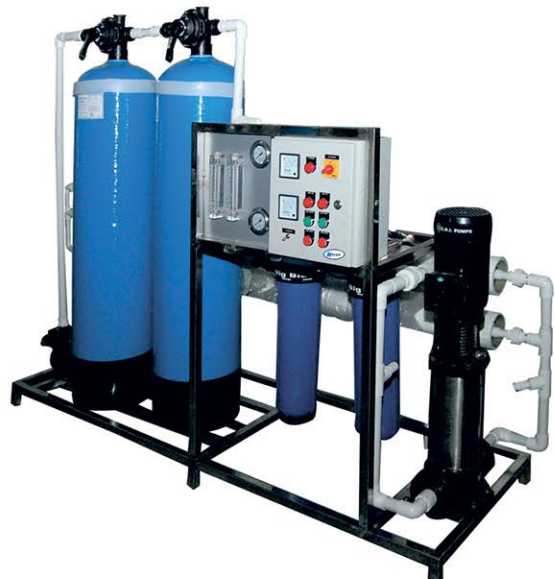
Kenjal 1000 LPH RO