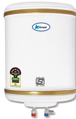
Kenjal METAL 15 LTR