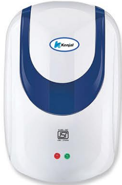
Kenjal ABS 25 LTR