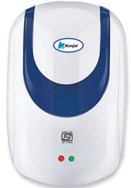
Kenjal ABS 15 LTR