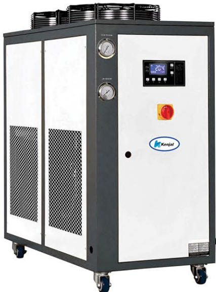
Kenjal ONLINE WATER CHILLER