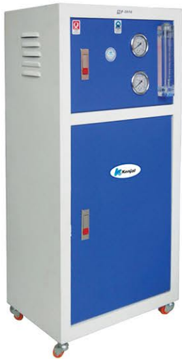
Kenjal 50/100 LPH RO