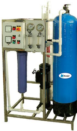
Kenjal 250 LPH RO