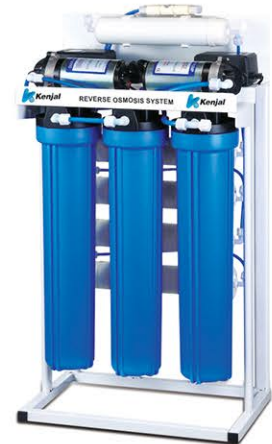
Kenjal 50 LPH RO